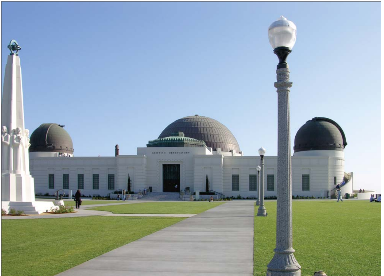
The North face of the newly renovated Griffith Observatory. The lawn hides over 30,000 square feet of underground exhibits. Story on page 16.